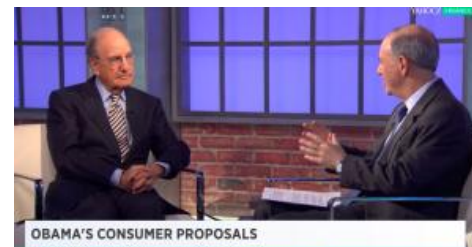
George Mitchell: Why business and government hate each other