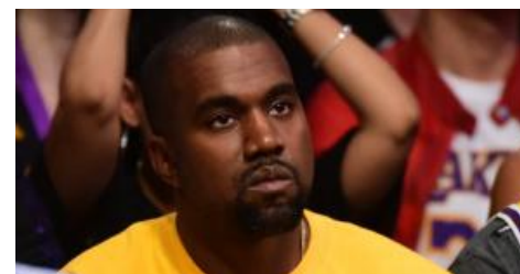
Tidal lawsuit: Kanye 'duped consumers'