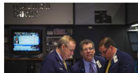
Goldman Sachs: 'Virtually every one of our businesses' got slammed