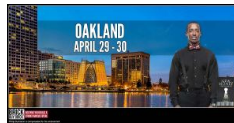
Free Event in Oakland, April 30! Sponsored Brick Buy Brick