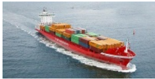
European carrier Containerships has adopted the EquipmentRepair system

European carrier Containerships has adopted the EquipmentRepair™ system from International Asset Systems (IAS)